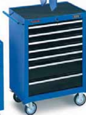
Stock No.78225 RC7