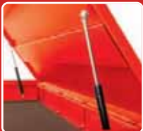
Two heavy-duty robust pneumatic struts.