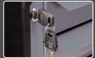
Cylinder barrel locks and two keys.