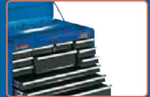
Anti-slip mats fitted to drawers (except TC6A)