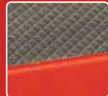
Both the 51173 and the 43937 have protective EVA foam covering on the top.