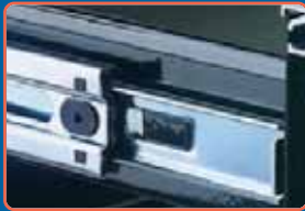
Ball bearing runners on all drawers