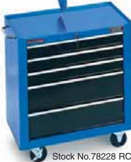
Stock No.78228 RC5