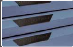
Ergonomically formed handles for superior grip.