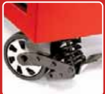
Ultra durable castors, fitted with deep rubber tyres.