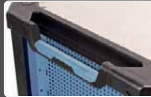
"Pull-along" handles for portability around the workshop.