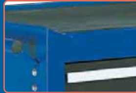
Sheet steel, with a tough oven baked powder coat.