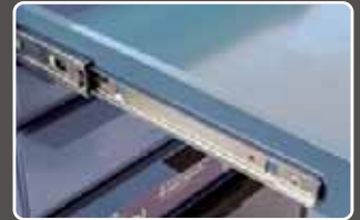
Ball bearing runners on all drawers.