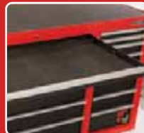
All drawers fitted with 3mm EVA foam padding & heavy duty ball bearing sliders.