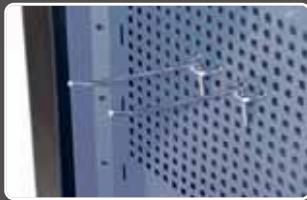
Integrated tool peg board for additional storage.