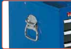
Tool chests are fitted with tough chrome plated lifting handles....