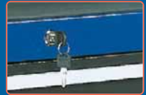
and all come with cylinder barrel locks and two keys.