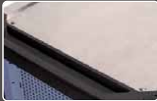
Stainless steel tops for durability and strength.