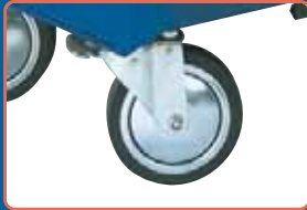
Fitted with heavy duty or swivelling and braked castors.