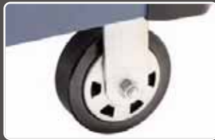
Fitted with heavy duty fixed and braked swivelling castors.