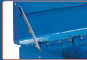
Robust maintenance-free struts.